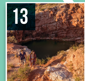
13 At Bottomless Lakes State Park enjoy non-motorized boating, in your kayak or canoe, camp, go birding or even scuba dive!