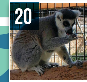
20 Spring River Zoo is a 34-acre preserve featuring animals, an antique carousel, a ranching exhibit and a children's area.