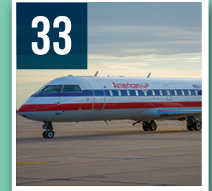
33 The Roswell Air Center is home to loads of history. Hanger 84 for instance, rumored to have held pieces of a recovered flying saucer.