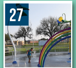
27 The Carpenter Park Splash Pad provides numerous water features for children and adults to enjoy while cooling off.