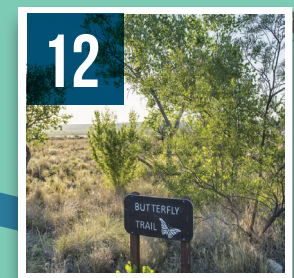
12 Bitter Lake is home to what is considered one of the most diverse populations of birds and dragonflies in North America.