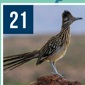
21 The J. Kenneth Smith Bird Sanctuary is a nice place to check out some interesting birds and relax.