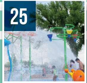
25 The Bert Murphy Family Splash Pad provides numerous water features for children and adults to enjoy while cooling off.