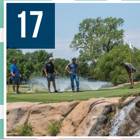
17 Nancy Lopez Golf Course at Spring River is a golf facility that lies on 144 acres of scenic land that was once home to a beautiful running river.